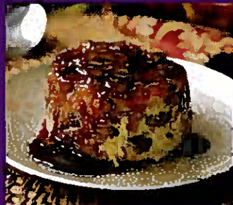
❖ Spiced pumpkin & whisky bread pud