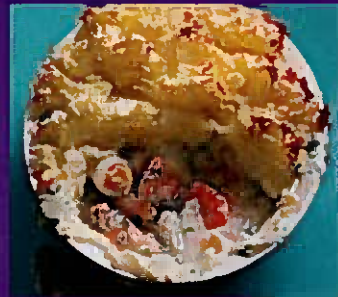
❖ Creamy fish pie with saffron mash