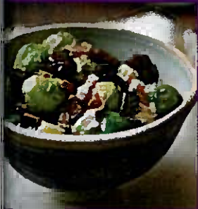
Brussels sprouts with bacon & chestnuts