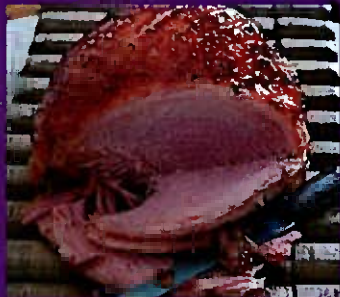
❖ Ultimate Christmas glazed ham