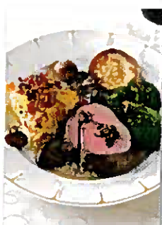
New sides & veg