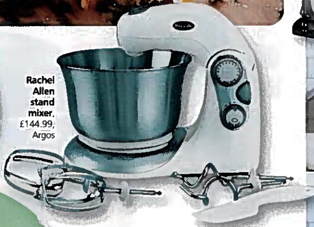
Rachel Allen stand mixer, £144.99, Argos

This stylish mixer with a five-litre bowl has six speeds, plus a pulse function. It comes complete with a balloon whisk, beater and dough hook attachments, as well as some tasty recipe ideas