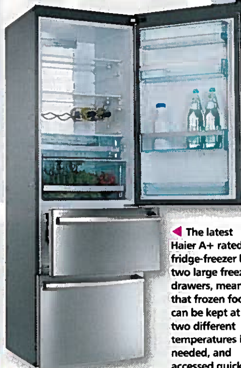
Haier AFL631CS/U fridge-freezer, around £599.99, Comet