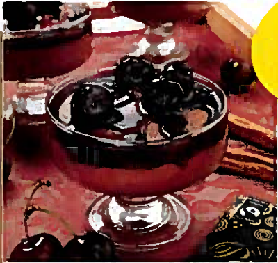
DELICIOUS RECIPES THAT ARE PERFECT FOR PARTIES

497 creative ideas for every room Designed to save you money