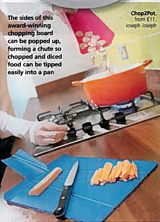
Chop2Pot, from £11, Joseph Joseph

The sides of this award-winning chopping board can be popped up, forming a chute so chopped and diced food can be tipped easily into a pan