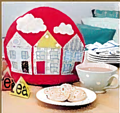
BEAUTIFUL CRAFTS AND SIMPLE SEWING PROJECTS