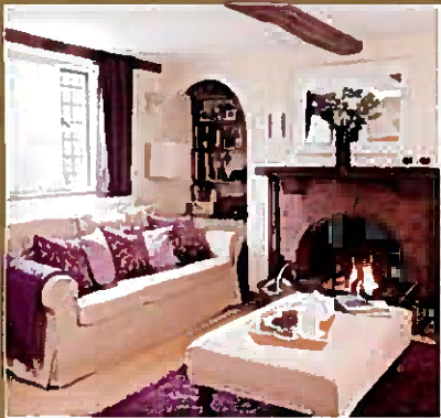
AFFORDABLE MAKEOVERS FOR A BRAND NEW LOOK