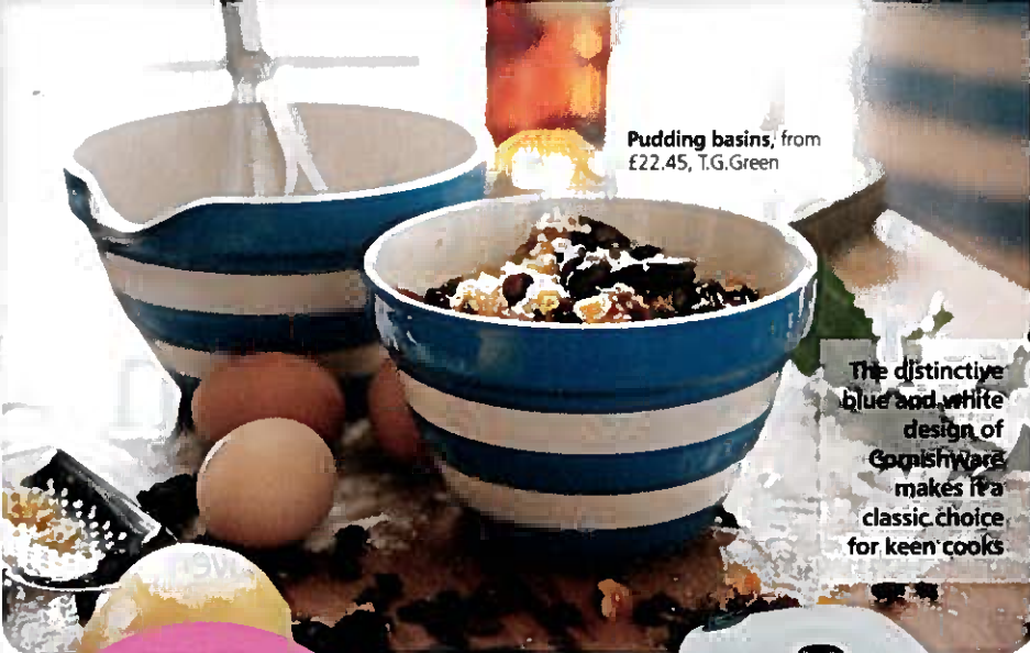
Pudding basins, from £22.45, T.G.Green

The distinctive blue and white design of Copish Ware makes it a classic choice for keen cooks