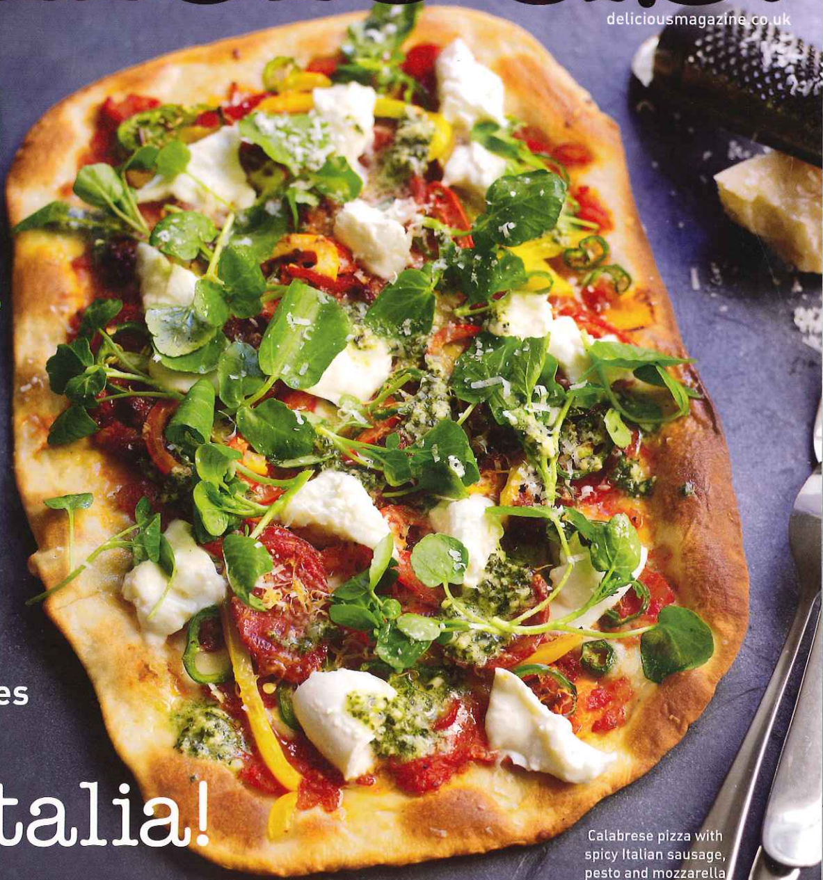
Calabrese pizza with spicy Italian sausage, pesto and mozzarella

on Francesco Mazzei's menu* *T&Cs apply. See p110