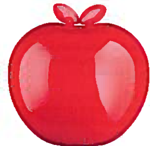
'Boskop' plastic apple lunch box by Koziol, £8.50, Groovytek ( groovytek.co.uk )