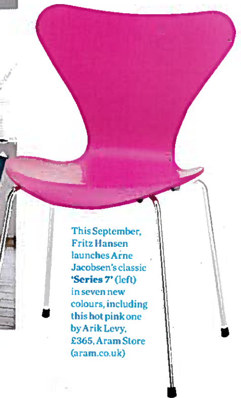
This September, Fritz Hansen launches Arne Jacobsen's classic 'Series 7' (left) in seven new colours, including this hot pink one by Arik Levy, £365, Aram Store ( aram.co.uk )