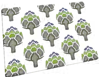
'Artichoke' worktop saver, £13, Joseph Joseph ( josephjoseph.com )