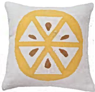
'Lemon' hand-loomed wool cushion, £60, Jonathan Adler ( jonathanadler.com )