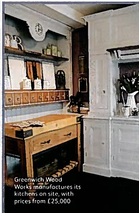
Greenwich Wood Works manufactures its kitchens on site, with prices from £25,000

» ALNO, 120 Wigmore Street W1U 3LS (020 7486 3080; alno.co.uk) OPEN Mon to Fri 10am to 5.30pm; Sat 10am to 4pm