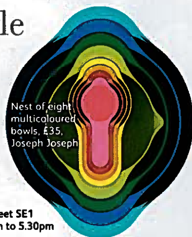
Nest of eight multicoloured bowls, £35, Joseph Joseph

» Joseph Joseph, Unit 121, Oxo Tower Wharf, Bargehouse Street SE1 9PH (020 7261 1800; josephjoseph.com) OPEN Mon to Fri 9am to 5.30pm