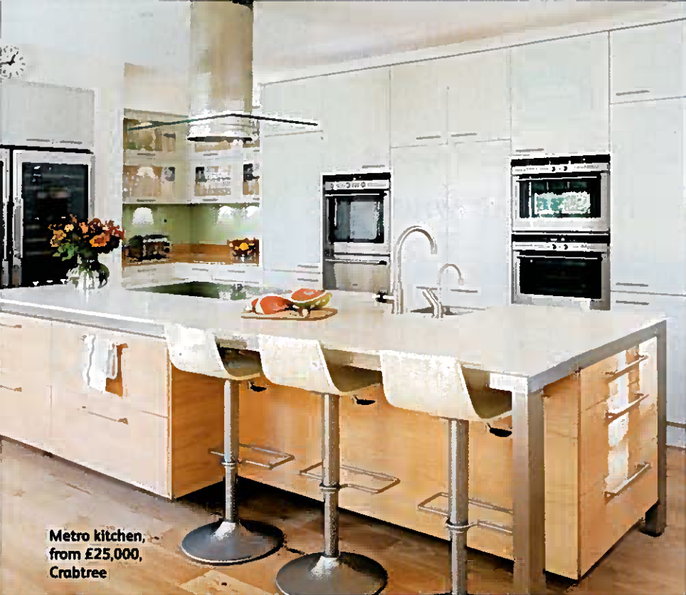
Metro kitchen, from £25,000, Crabtree